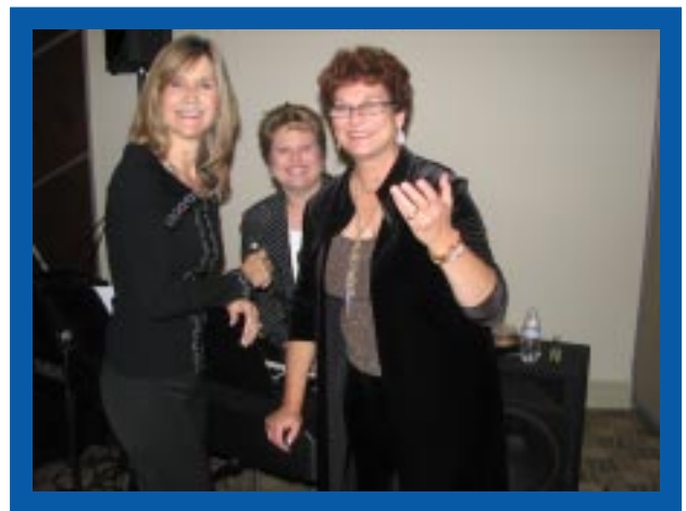
"Dream Girls of Palomar" heats up Thursday night reception.