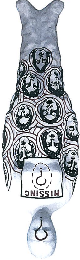
The California Community Colleges Missing Student Project Statue

Student Participation Rate By Population Loss | Gain